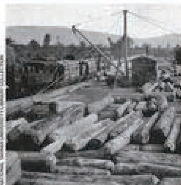
林田山森林鐵道遺址 林田山森林鐵道遺址 林田山森林鐵道遺址