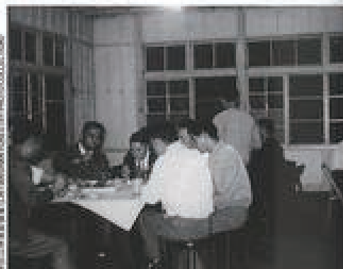
林田山森林鐵道遺址 林田山森林鐵道遺址 林田山森林鐵道遺址

During the Japanese colonisation of Taiwan, between 1905 and 1945, four large forestry sites were established on the island, including Lintianshan (top). Push carts were used to transport logs, with operators holding wooden levers to slow them down and avoid accidents (above left). Rail infrastructure (left) established by Japanese engineers connected the sites and enabled the shipping of forestry products back to Japan