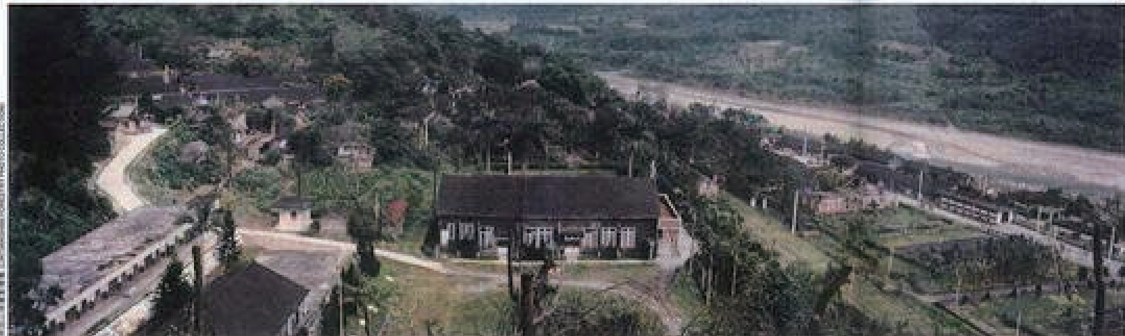
林田山森林鐵道遺址 林田山森林鐵道遺址 林田山森林鐵道遺址